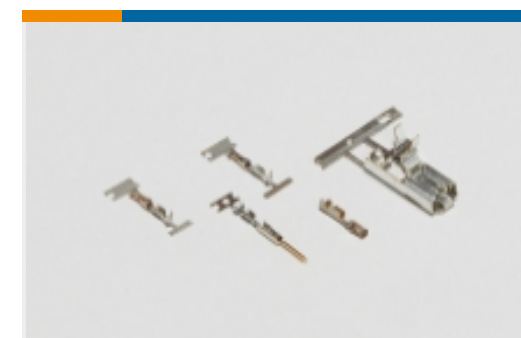
Wire-to-Board Connector Contacts(7)