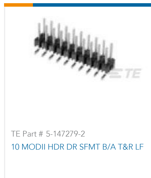
TE Part # 5-147279-2 10 MODII HDR DR SFMT B/A T&R LF