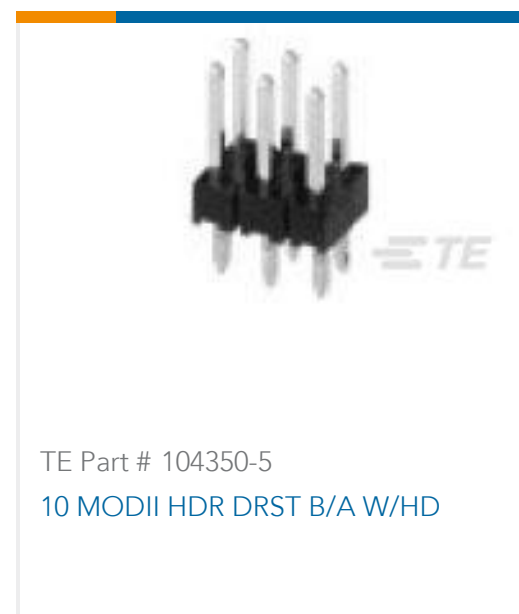
TE Part # 104350-5 10 MODII HDR DRST B/A W/HD