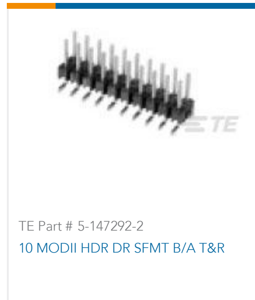
TE Part # 5-147292-2 10 MODII HDR DR SFMT B/A T&R