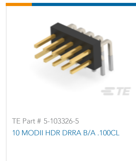
TE Part # 5-103326-5 10 MODII HDR DRRR B/A .100CL