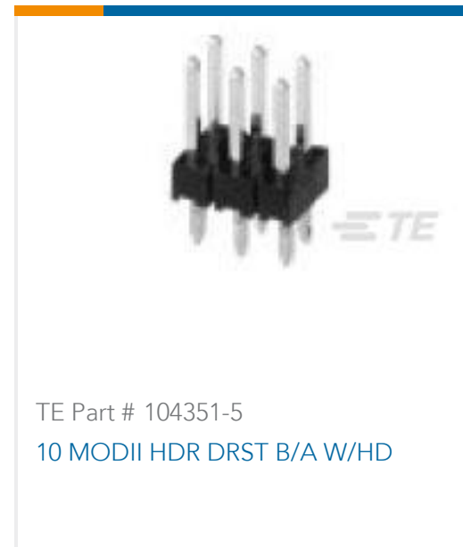
TE Part # 104351-5 10 MODII HDR DRST B/A W/HD