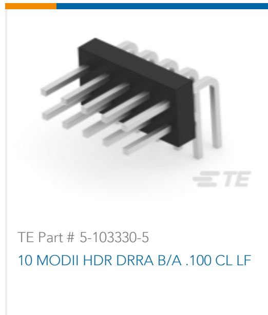
TE Part # 5-103330-5 10 MODII HDR DRRR B/A .100 CL LF