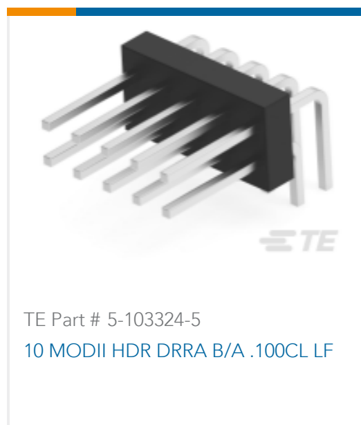
TE Part # 5-103324-5 10 MODII HDR DRRR B/A .100CL LF