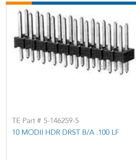
TE Part # 5-146259-5 10 MODII HDR DRST B/A .100 LF